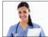
Stroke specialist nurse